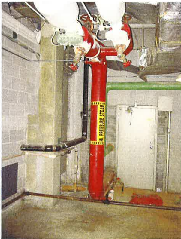
ROOM B-6 -- MAIN STEAM LINE