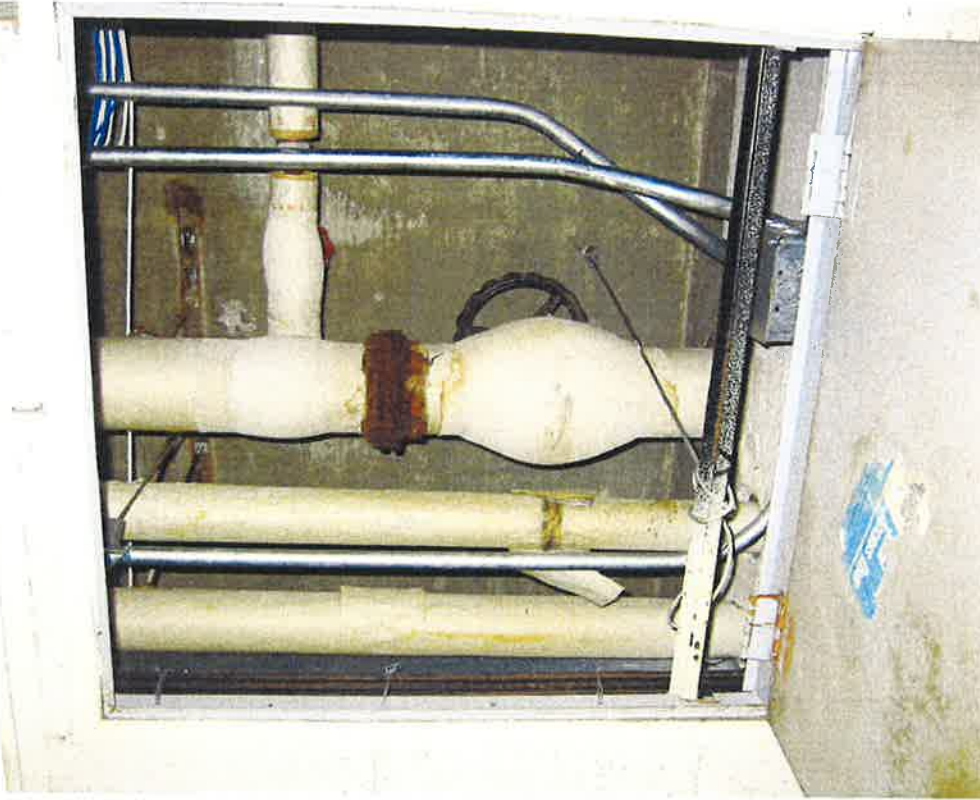
H-1 BASEMENT HALLWAY - PIPING ABOVE CEILING HATCH