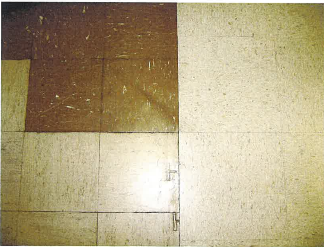
ROOM B-1 -- FLOOR TILE