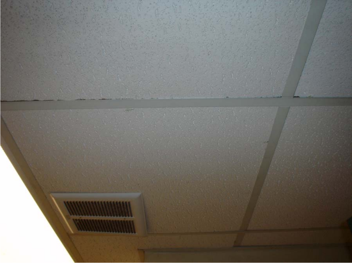
HA #1 – Non asbestos-containing 2' x 2' white lay-in ceiling tile with pin holes and fissures

For more information contact MSU Environmental Health and Safety – (517) 353-8956