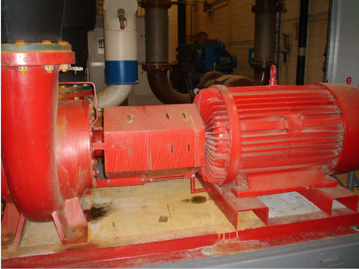
Paint HA #5 – Lead-containing red paint

For more information contact MSU Environmental Health and Safety – (517) 353-8956