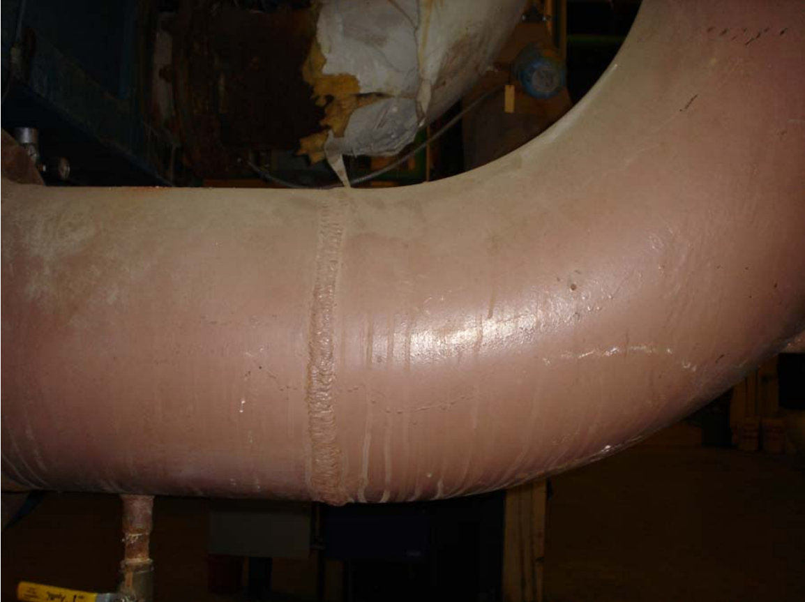
Paint HA #1 – Lead-containing brown paint

For more information contact MSU Environmental Health and Safety – (517) 353-8956