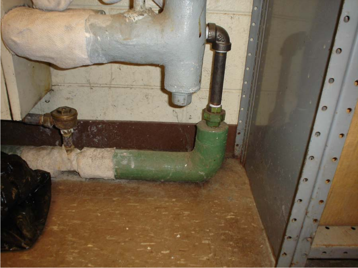
HA #5 – Asbestos-containing steam/condensate supply and return pipe joint and hanger insulation

For more information contact MSU Environmental Health and Safety – (517) 353-8956