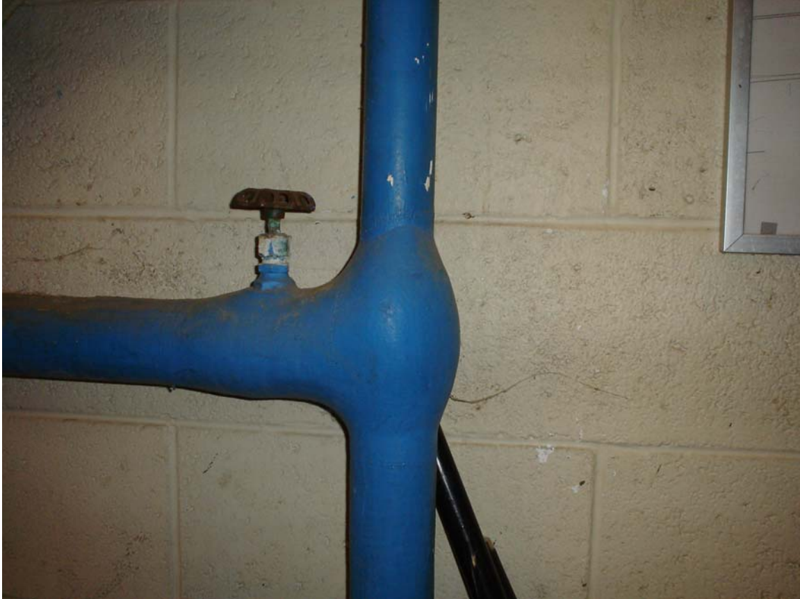
HA #6 – Non asbestos-containing domestic water supply pipe joint and hanger insulation

For more information contact MSU Environmental Health and Safety – (517) 353-8956