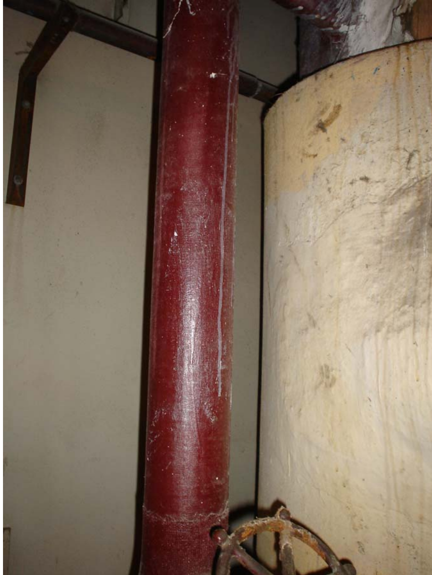
HA #4 – Asbestos-containing steam/condensate supply and return pipe straight insulation

For more information contact MSU Environmental Health and Safety – (517) 353-8956