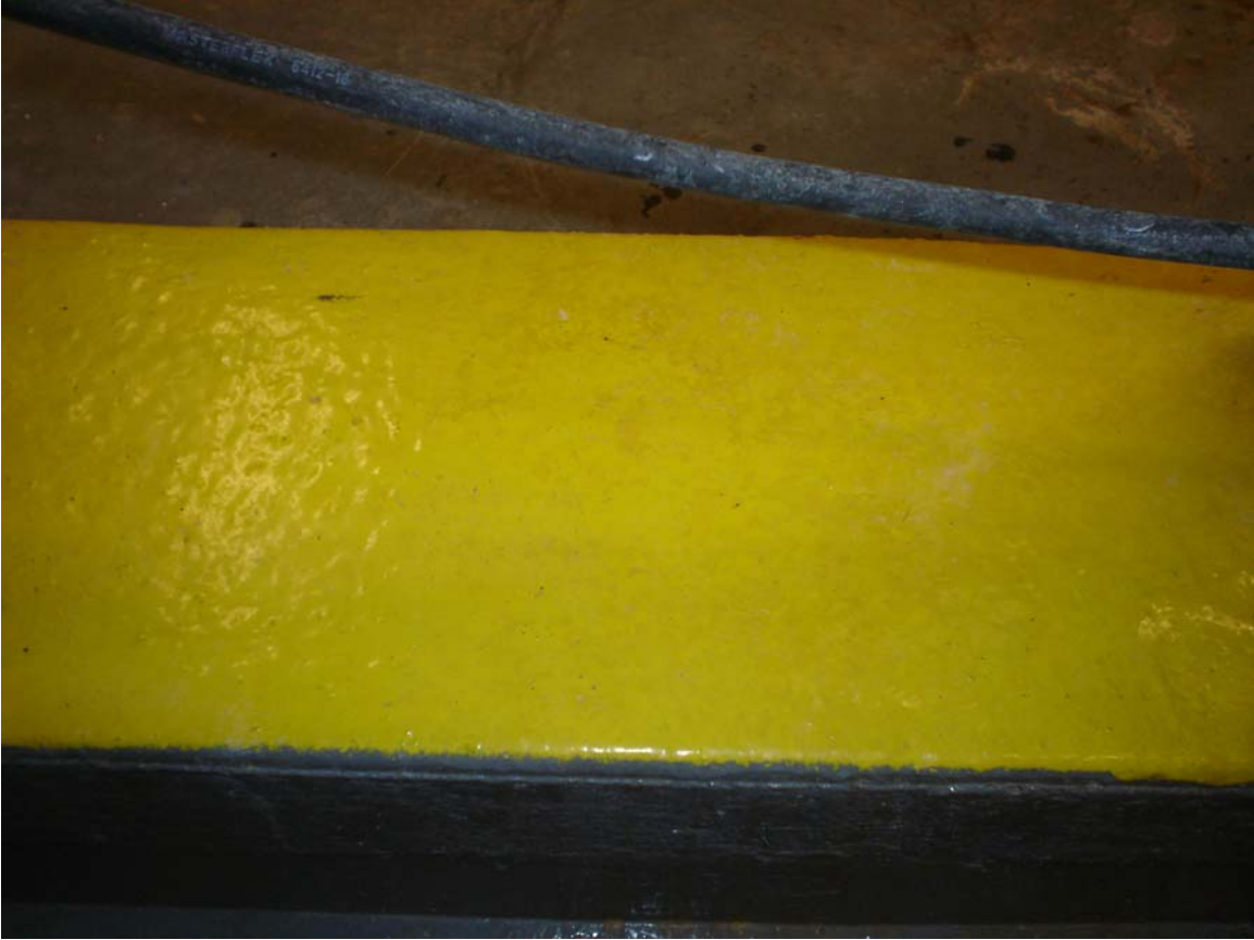
Paint HA #4 – Lead-containing yellow paint

For more information contact MSU Environmental Health and Safety – (517) 353-8956