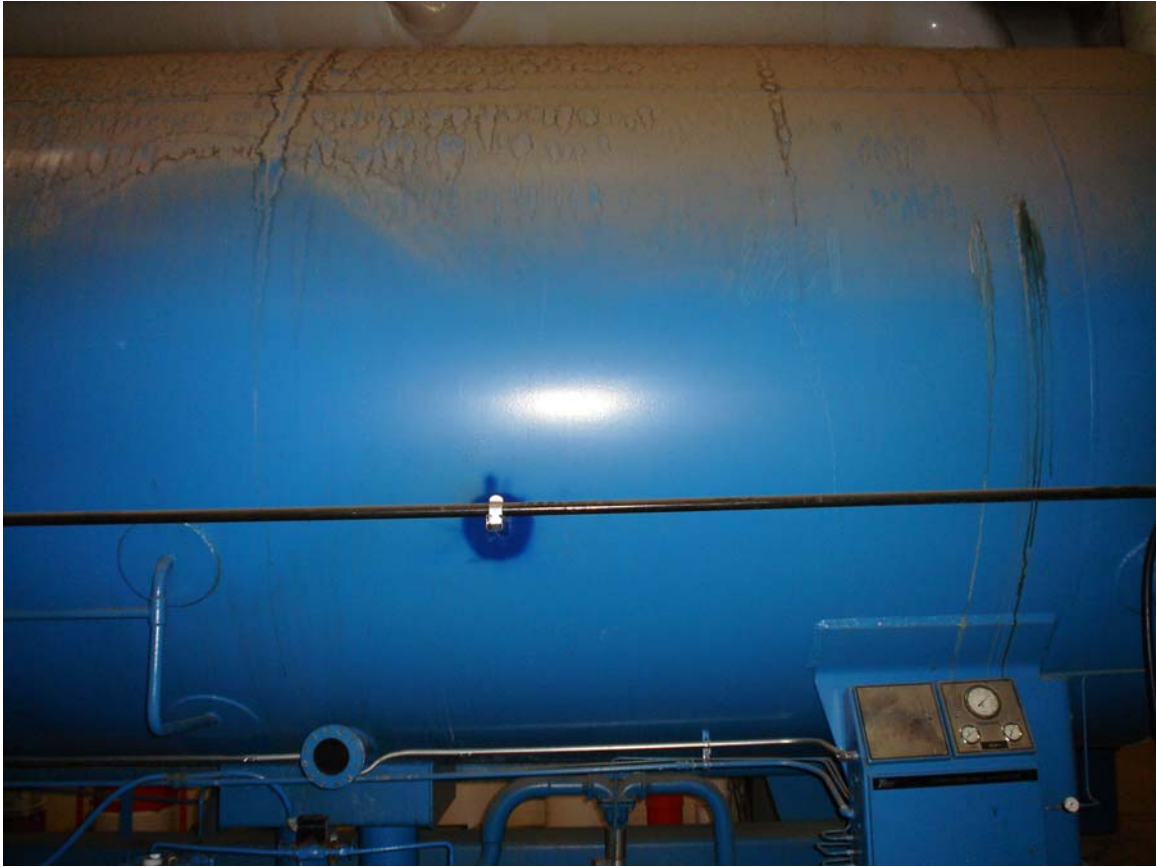
Paint HA #7 – Lead-containing blue paint

For more information contact MSU Environmental Health and Safety – (517) 353-8956