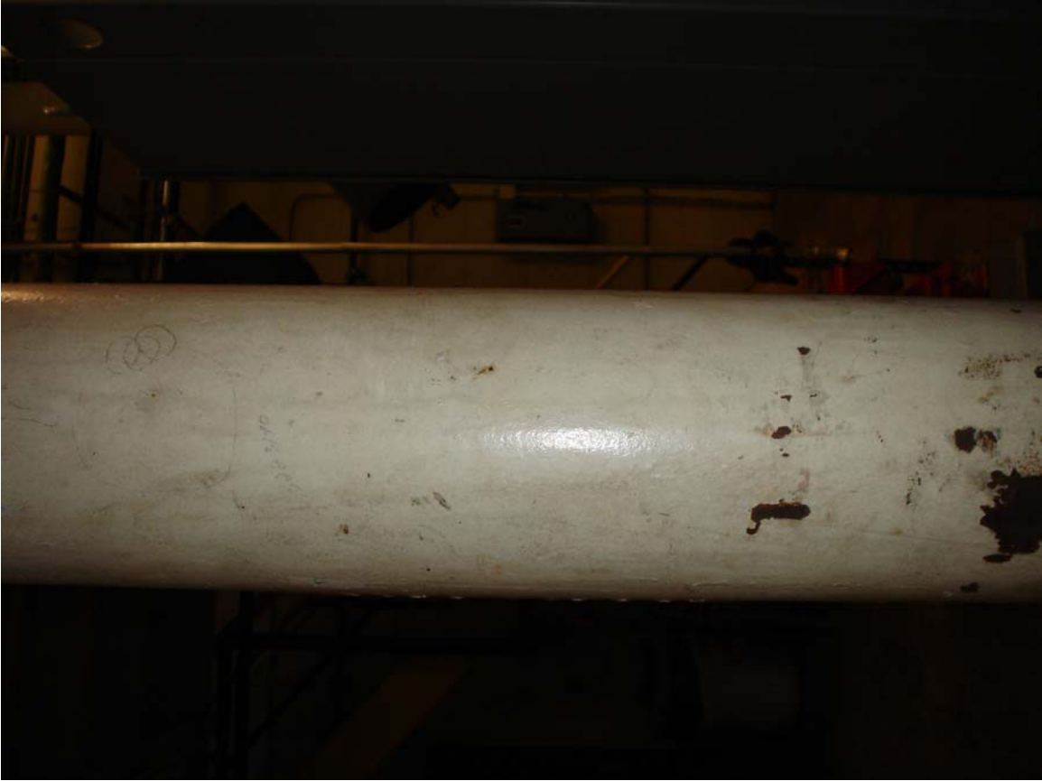
Paint HA #6 – Lead-containing white paint

For more information contact MSU Environmental Health and Safety – (517) 353-8956