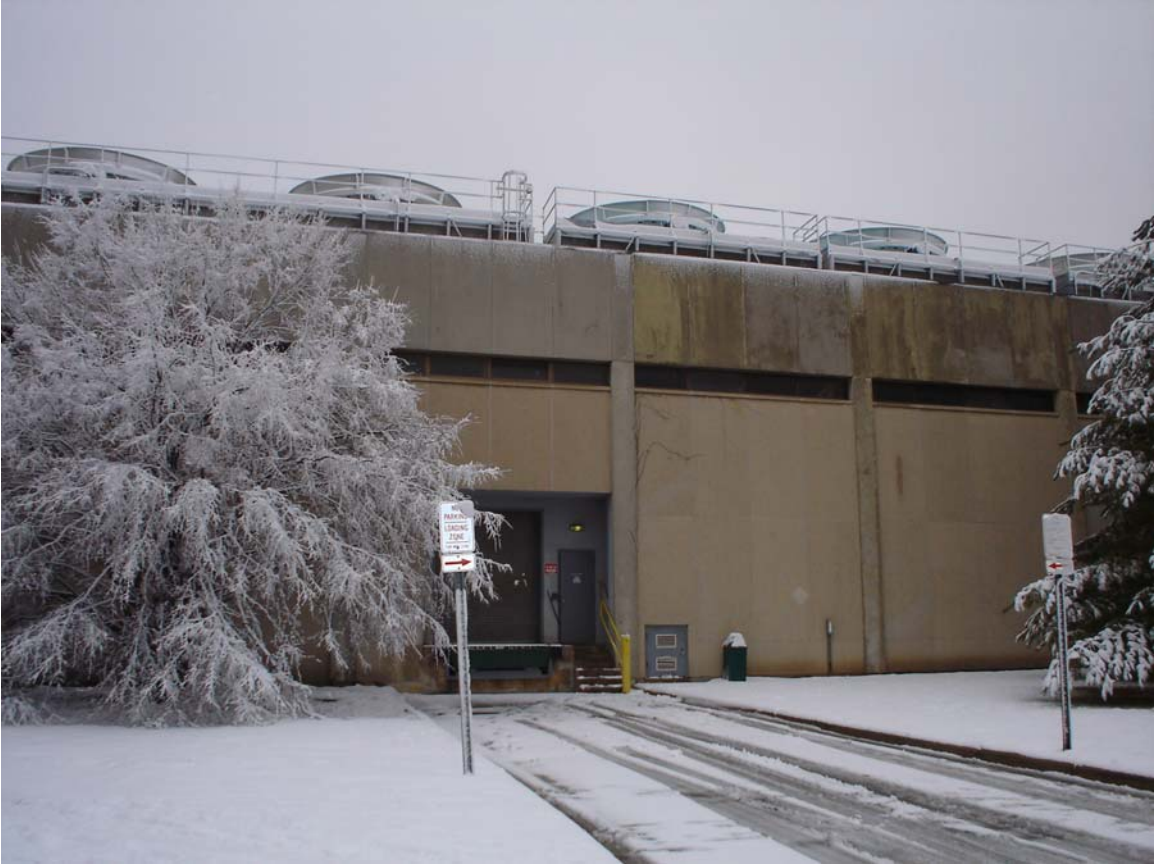
Exterior of building

For more information contact MSU Environmental Health and Safety – (517) 353-8956