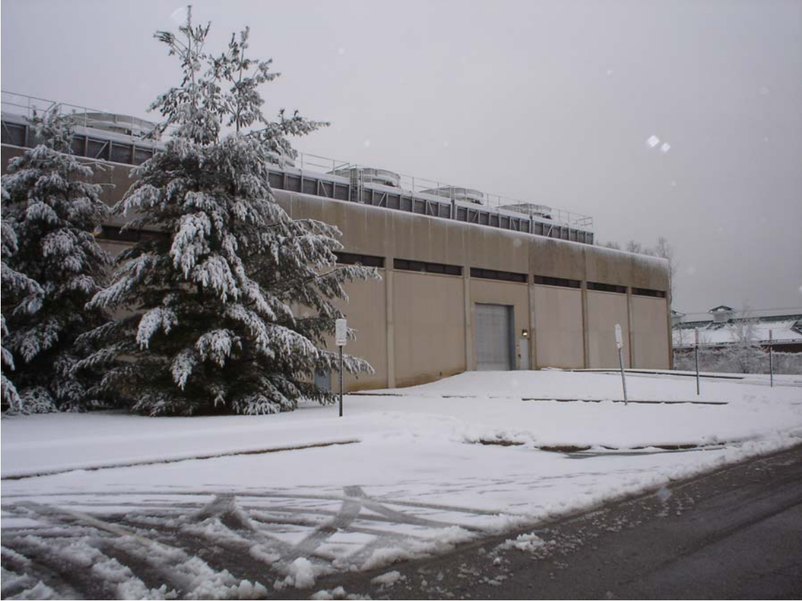
Exterior of building

For more information contact MSU Environmental Health and Safety – (517) 353-8956