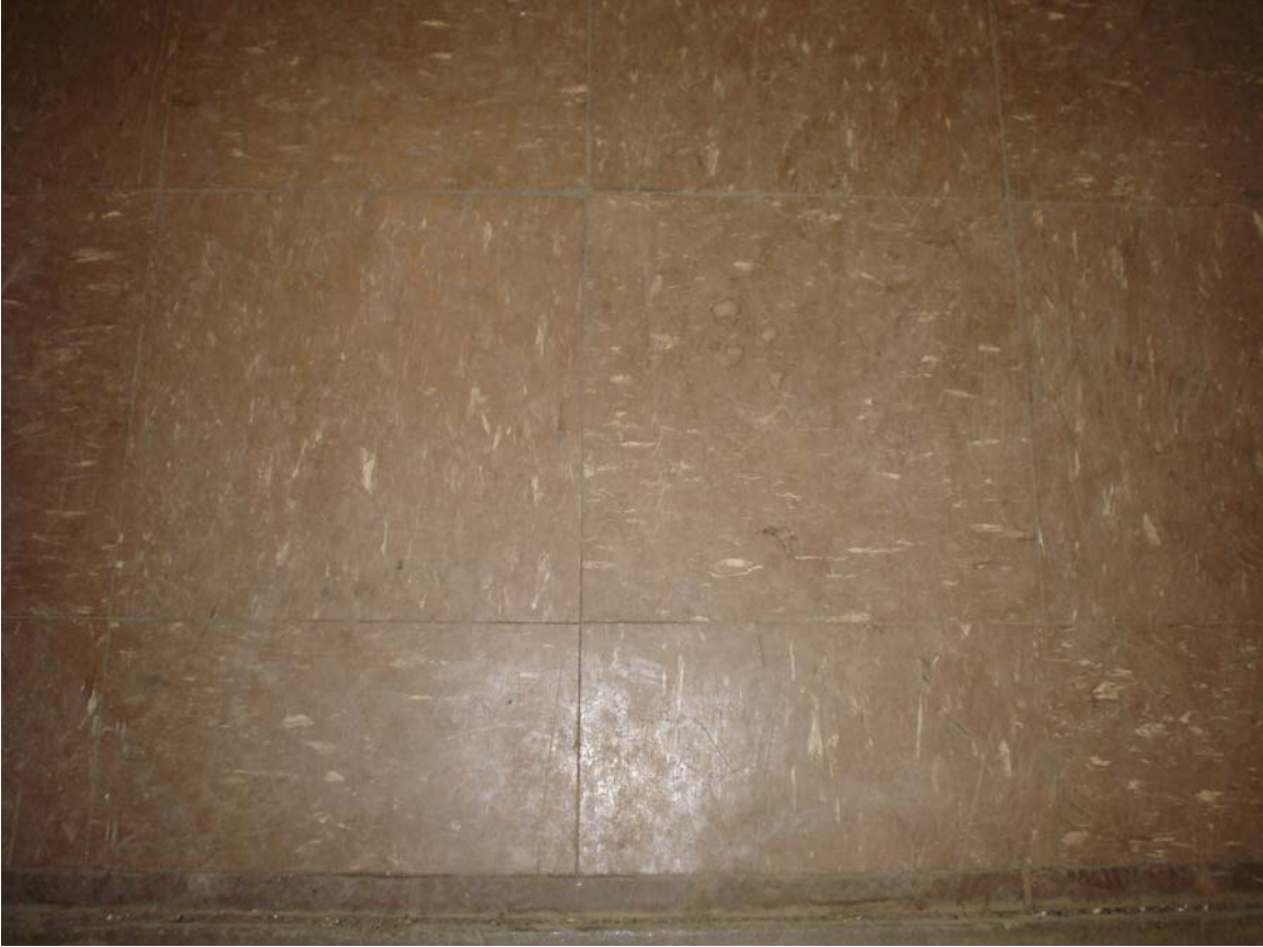
HA #3 – Asbestos-containing 12" x 12" brown floor tile with cream streaks and associated non asbestos-containing mastic

For more information contact MSU Environmental Health and Safety – (517) 353-8956