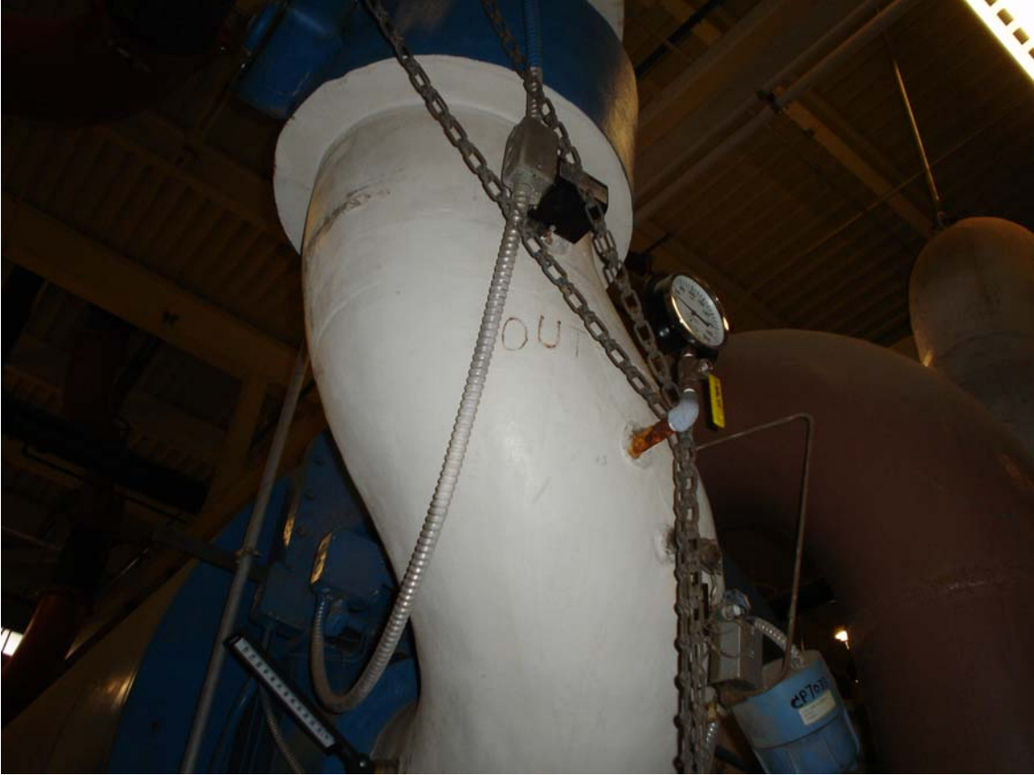
HA #7 – Non asbestos-containing chilled water supply and return pipe joint and hanger insulation

For more information contact MSU Environmental Health and Safety – (517) 353-8956