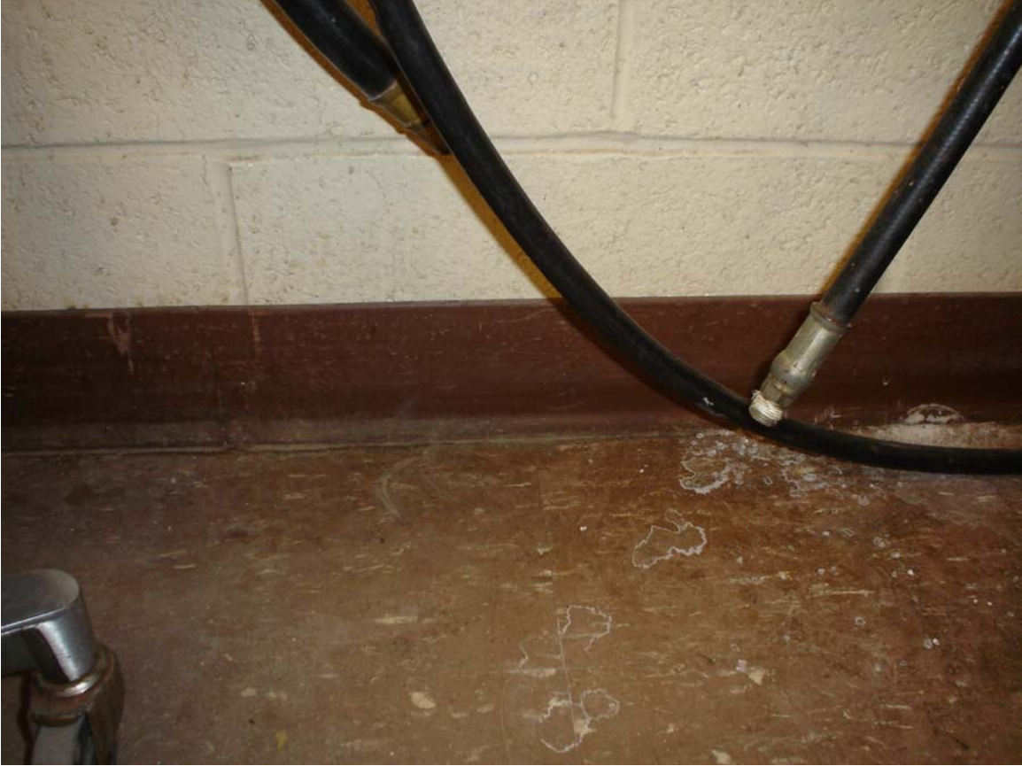
HA #2 – Non asbestos-containing 4" brown cove molding and associated mastic

For more information contact MSU Environmental Health and Safety – (517) 353-8956