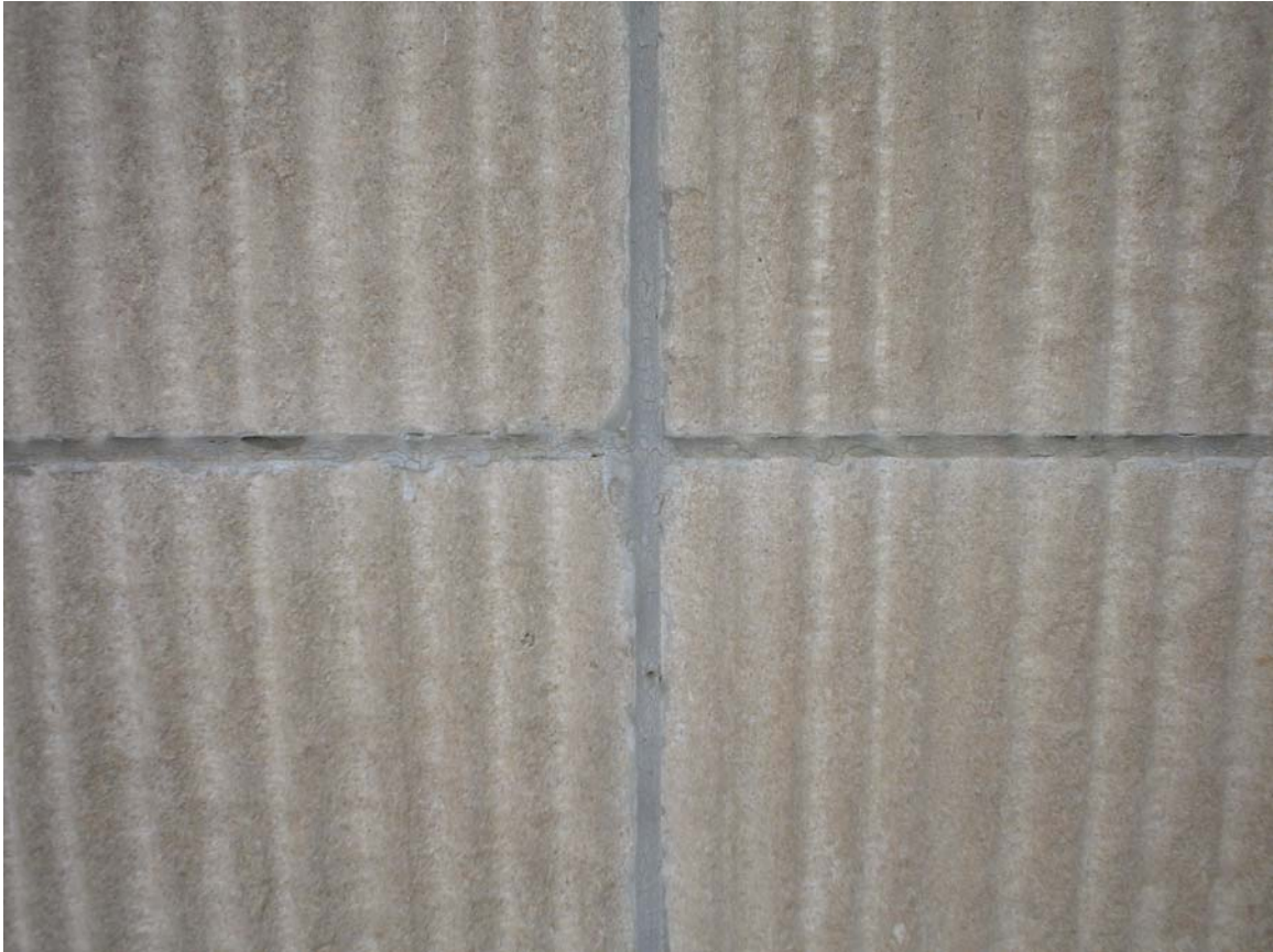
HA #10 – Assumed asbestos-containing gray building caulk compound

For more information contact MSU Environmental Health and Safety – (517) 353-8956