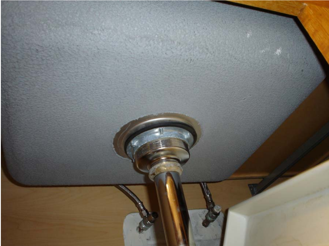
HA #10 – Non asbestos-containing gray sink undercoating insulation

For more information contact MSU Environmental Health and Safety – (517) 353-8956