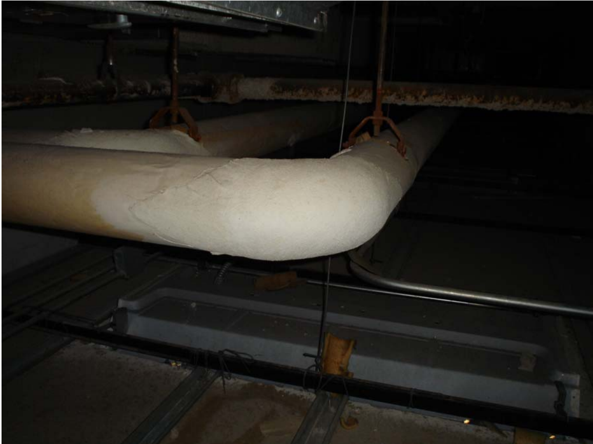
HA #5 – Asbestos-containing steam/condensate supply and return pipe joint and hanger insulation

For more information contact MSU Environmental Health and Safety – (517) 353-8956