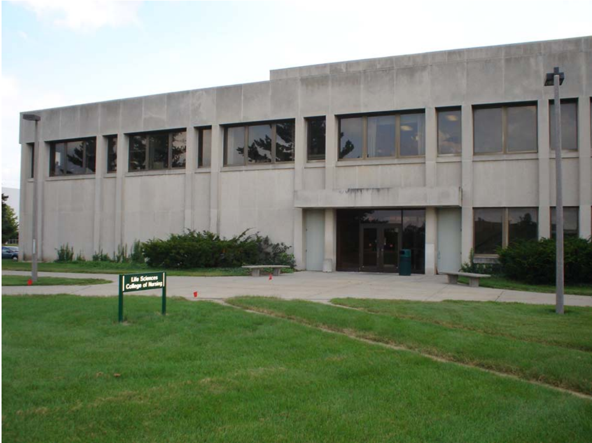
Exterior of Life Science Building

For more information contact MSU Environmental Health and Safety – (517) 353-8956