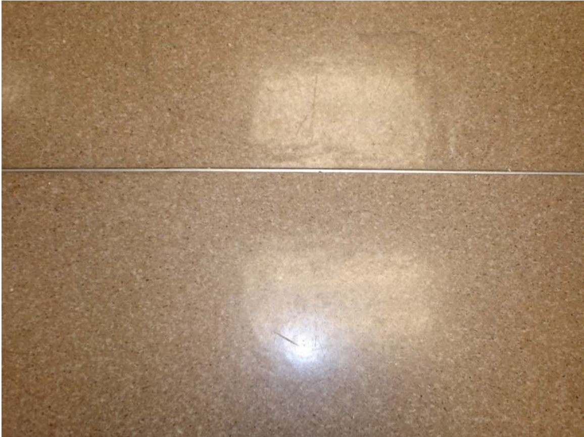
HA #17 – Non asbestos-containing tan linoleum with mosaic pattern and associated mastic

For more information contact MSU Environmental Health and Safety – (517) 353-8956