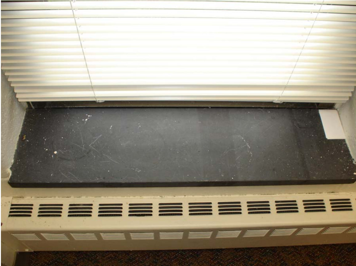
HA #45 – Assumed asbestos-containing black slate window sill

For more information contact MSU Environmental Health and Safety – (517) 353-8956