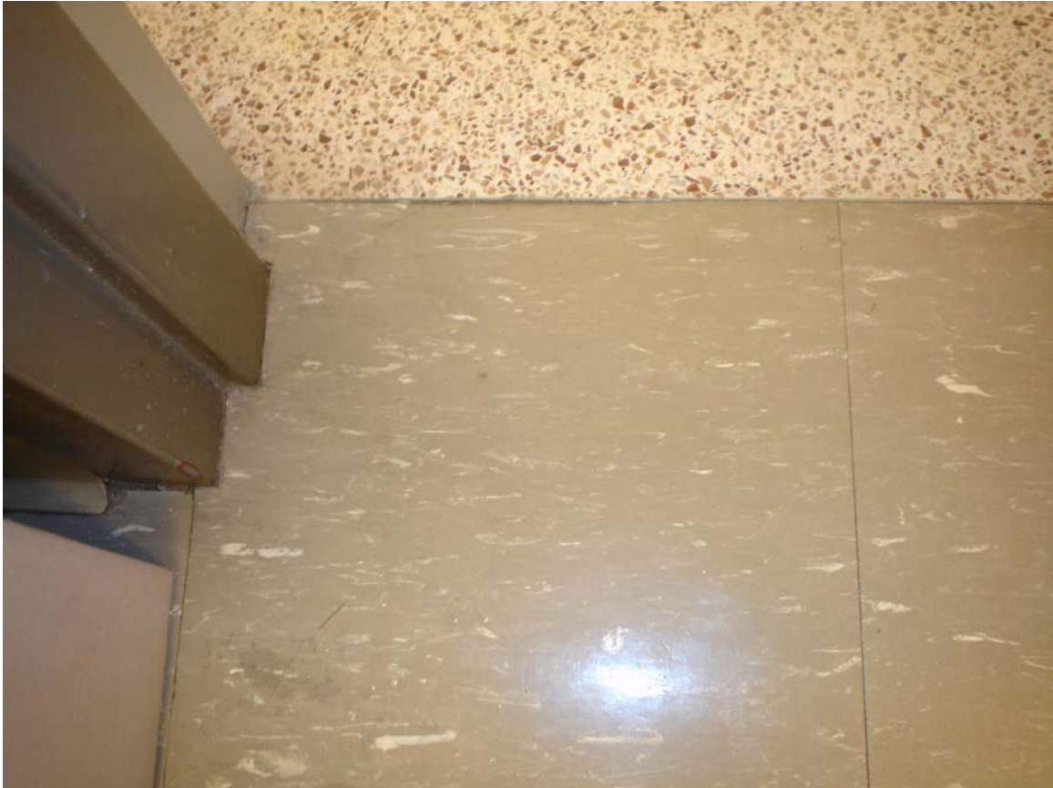
HA #16 – Non asbestos-containing 12” x 12” gray floor tile with white streaks and associated asbestos-containing mastic

For more information contact MSU Environmental Health and Safety – (517) 353-8956