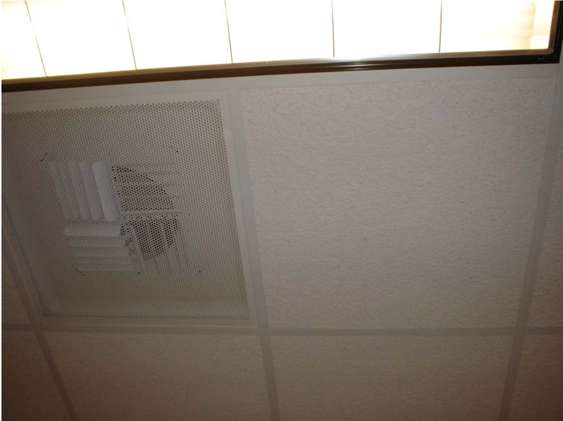
HA #42 – Non asbestos-containing 2' x 2' white lay-in ceiling tile with pin holes

For more information contact MSU Environmental Health and Safety – (517) 353-8956