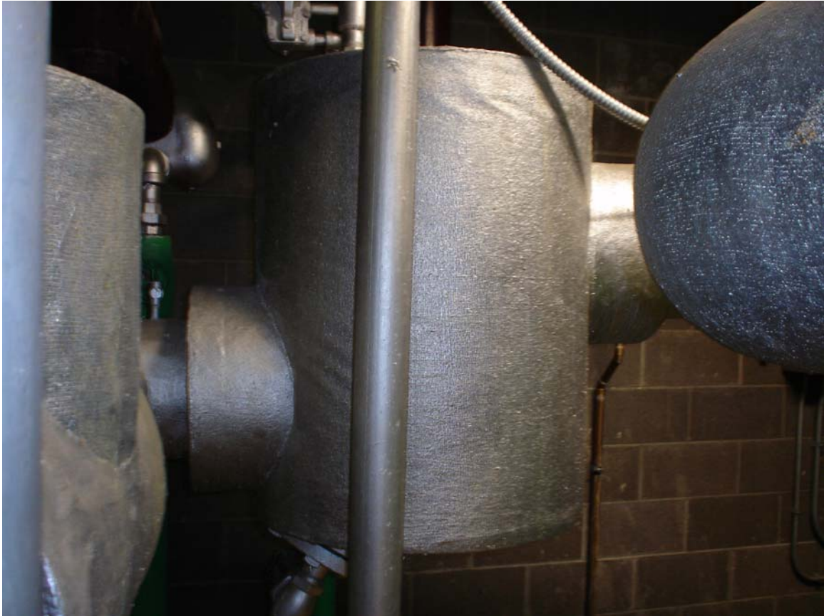
HA #57 – Asbestos-containing canvas wrap on fiberglass insulation

For more information contact MSU Environmental Health and Safety – (517) 353-8956