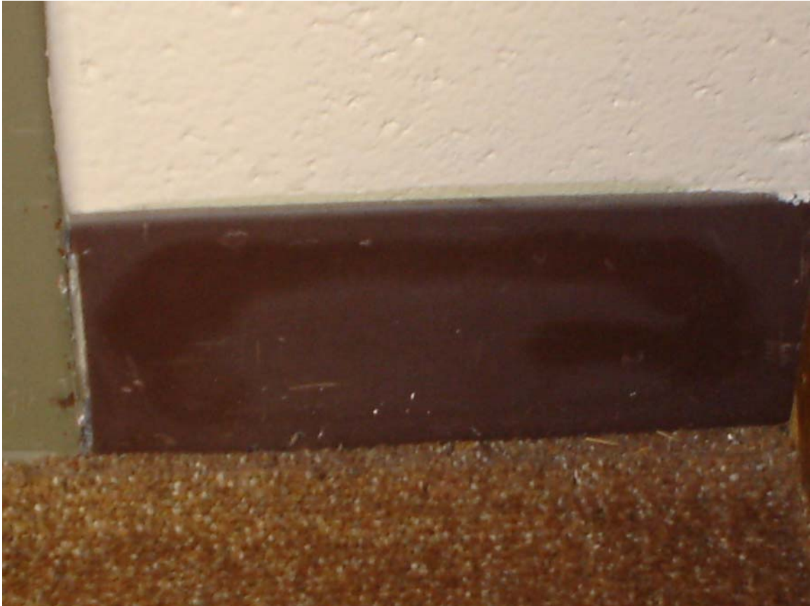
HA #11 – Non asbestos-containing 4” brown cove molding and associated mastic

For more information contact MSU Environmental Health and Safety – (517) 353-8956