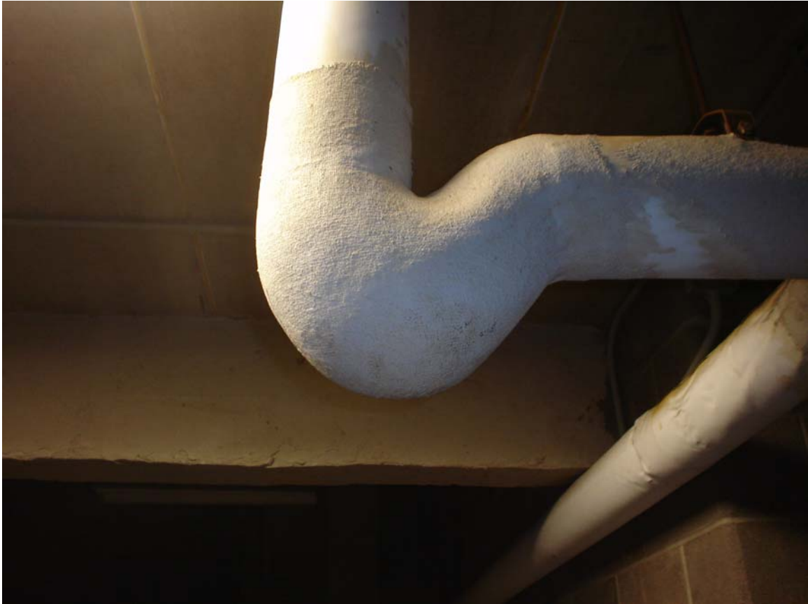
HA #49 – Asbestos-containing drain system pipe joint and hanger insulation

For more information contact MSU Environmental Health and Safety – (517) 353-8956