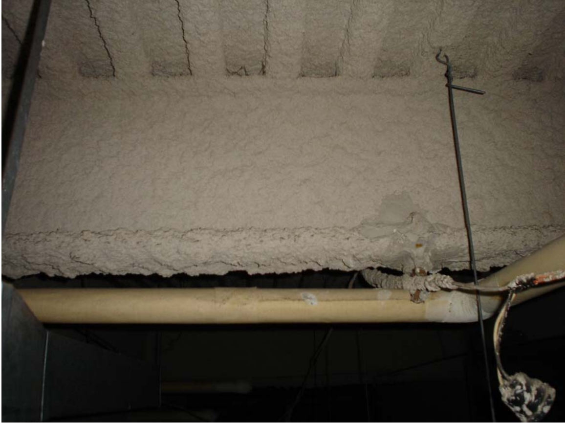
HA #1 – Asbestos-containing spray-on fireproofing

For more information contact MSU Environmental Health and Safety – (517) 353-8956