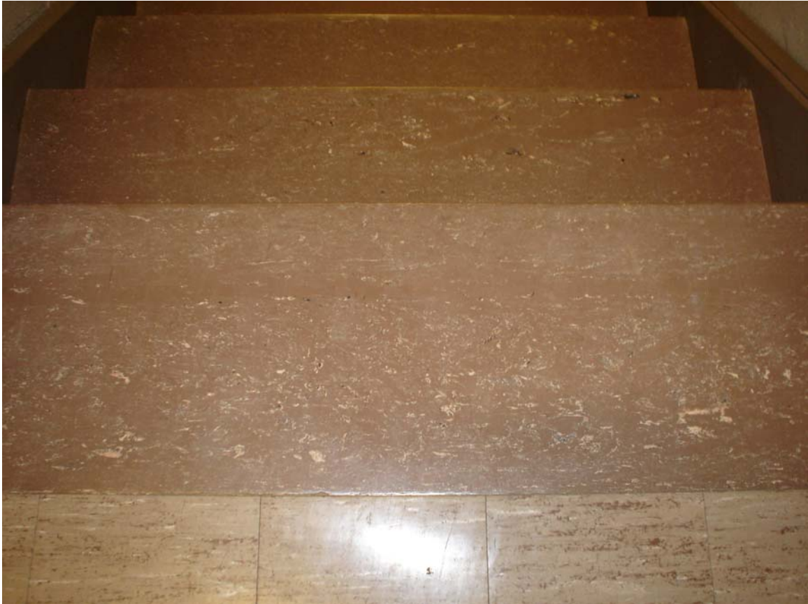
HA #56 – Asbestos-containing tan stair tread with cream, black and pink streaks and associated non asbestos-containing mastic

For more information contact MSU Environmental Health and Safety – (517) 353-8956