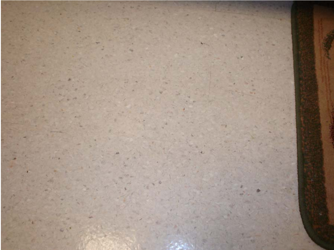
HA #39 – Non asbestos-containing 12” x 12” white floor tile with mosaic pattern and associated mastic

For more information contact MSU Environmental Health and Safety – (517) 353-8956