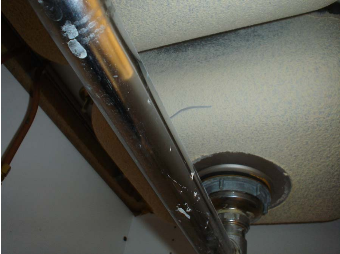
HA #40 – Non asbestos-containing white sink undercoating

For more information contact MSU Environmental Health and Safety – (517) 353-8956