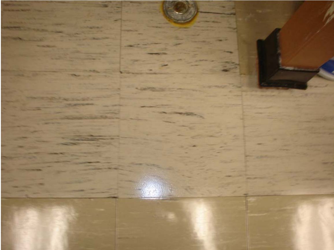
HA #27 – Asbestos-containing 9” x 9” cream floor tile with dark brown streaks and associated mastic

For more information contact MSU Environmental Health and Safety – (517) 353-8956