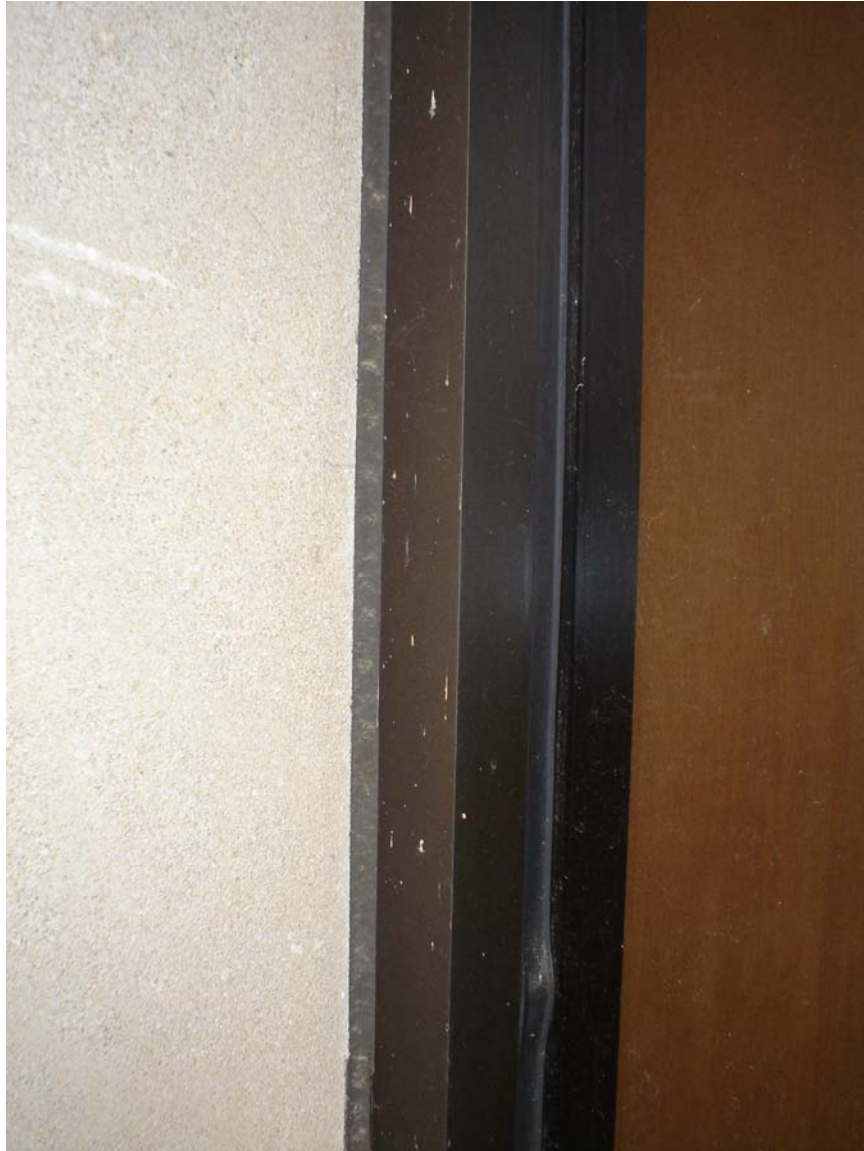
HA #30 – Assumed asbestos-containing window and door frame caulk compound

For more information contact MSU Environmental Health and Safety – (517) 353-8956