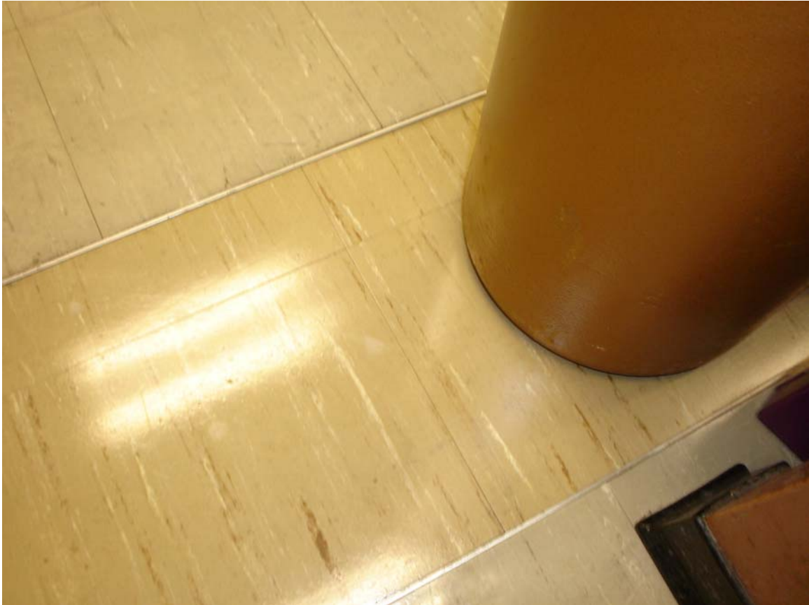
HA #21 – Non asbestos-containing 12” x 12” tan floor tile with cream and brown streaks and associated asbestos-containing mastic

For more information contact MSU Environmental Health and Safety – (517) 353-8956