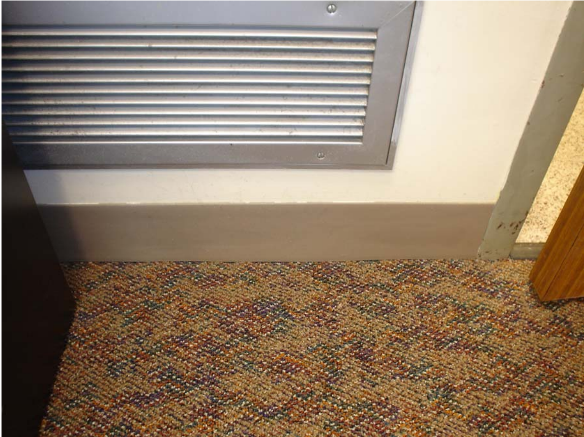
HA #46 – Non asbestos-containing 4” tan cove molding and associated mastic

For more information contact MSU Environmental Health and Safety – (517) 353-8956