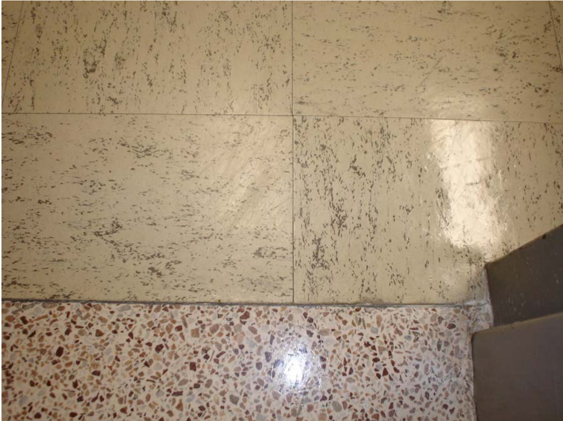
HA #37 – Non asbestos-containing 9” x 9” cream floor tile with black streaks and associated asbestos-containing mastic