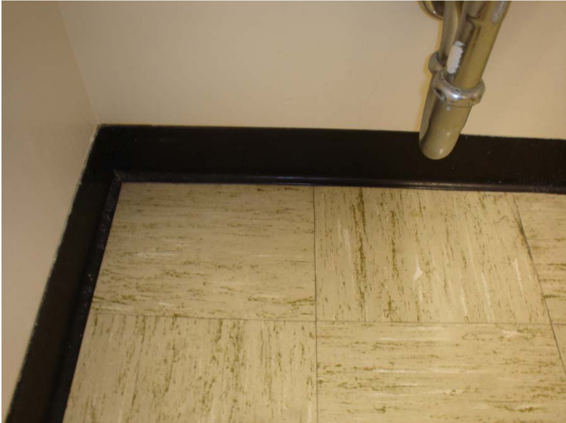
HA #25 – Non asbestos-containing 4” black cove molding and associated mastic

For more information contact MSU Environmental Health and Safety – (517) 353-8956