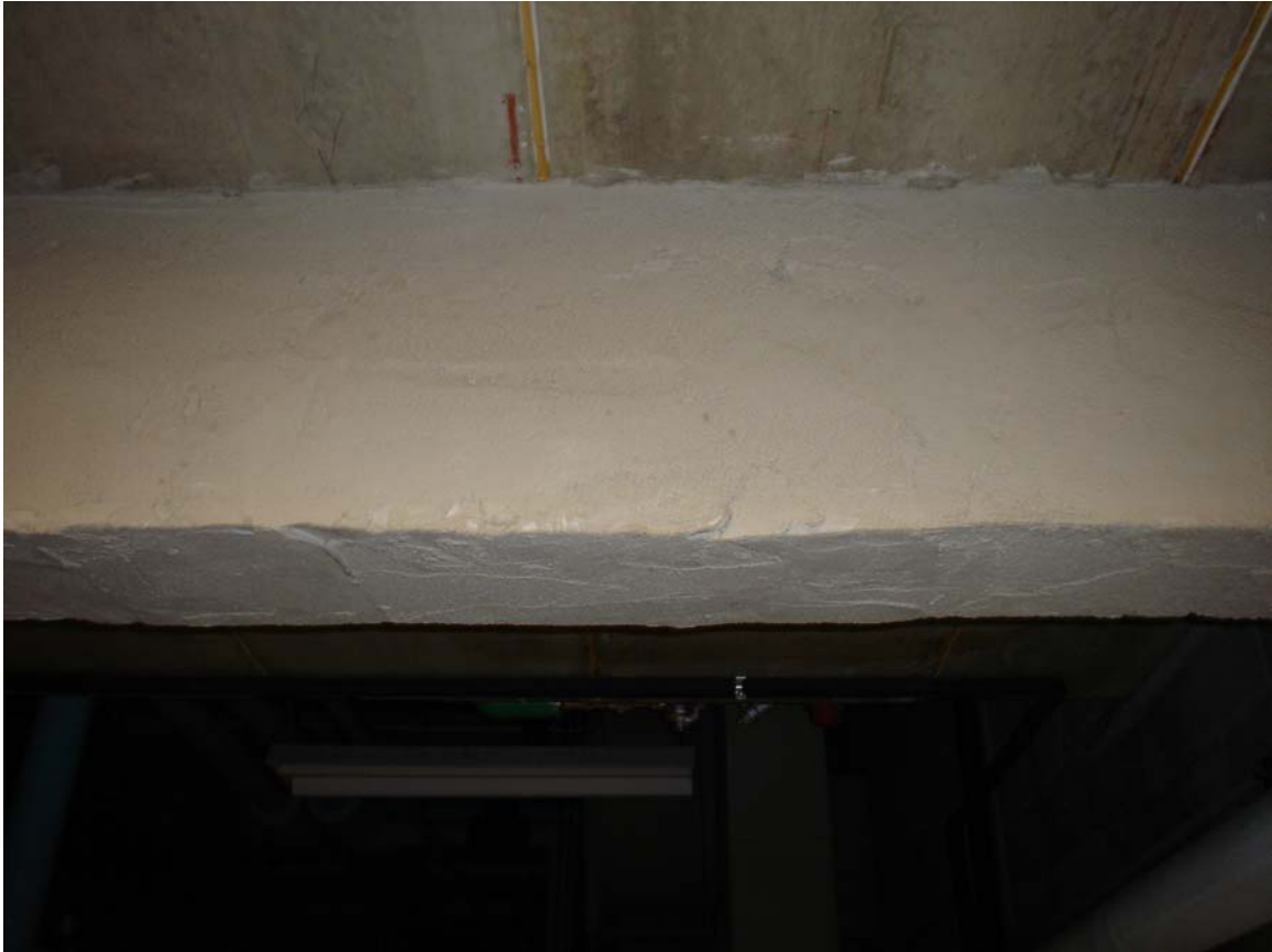
HA #54 – Non asbestos-containing trowelled-on fireproofing

For more information contact MSU Environmental Health and Safety – (517) 353-8956