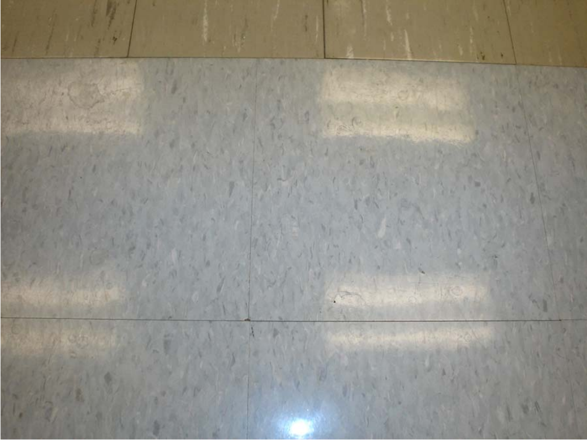
HA #12 – Non asbestos-containing 12” x 12” light blue floor tile with marble pattern and associated asbestos-containing mastic

For more information contact MSU Environmental Health and Safety – (517) 353-8956