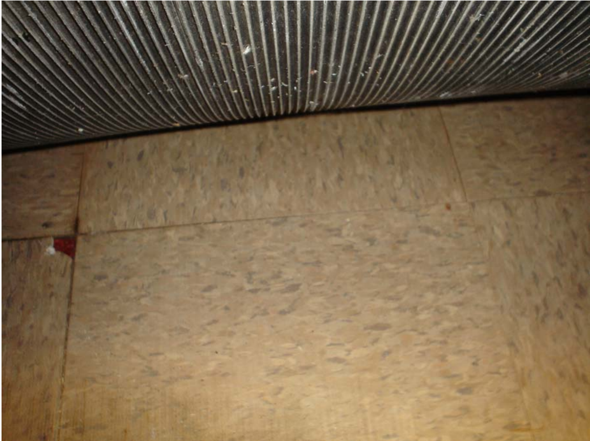
HA #19 – Asbestos-containing 12” x 12” tan floor tile with marble pattern and associated mastic

For more information contact MSU Environmental Health and Safety – (517) 353-8956