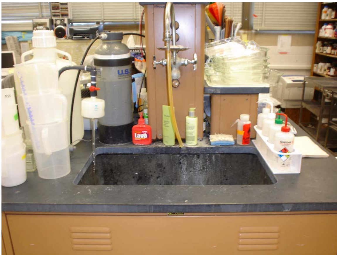
HA #14 – Assumed asbestos-containing black laboratory sink and table tops

For more information contact MSU Environmental Health and Safety – (517) 353-8956