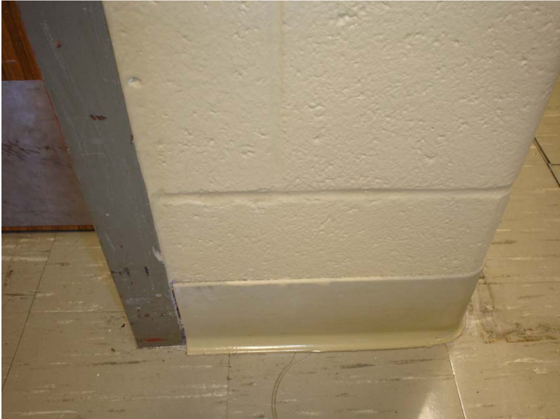
HA #9 – Non asbestos-containing 4” cream cove molding and associated mastic

For more information contact MSU Environmental Health and Safety – (517) 353-8956