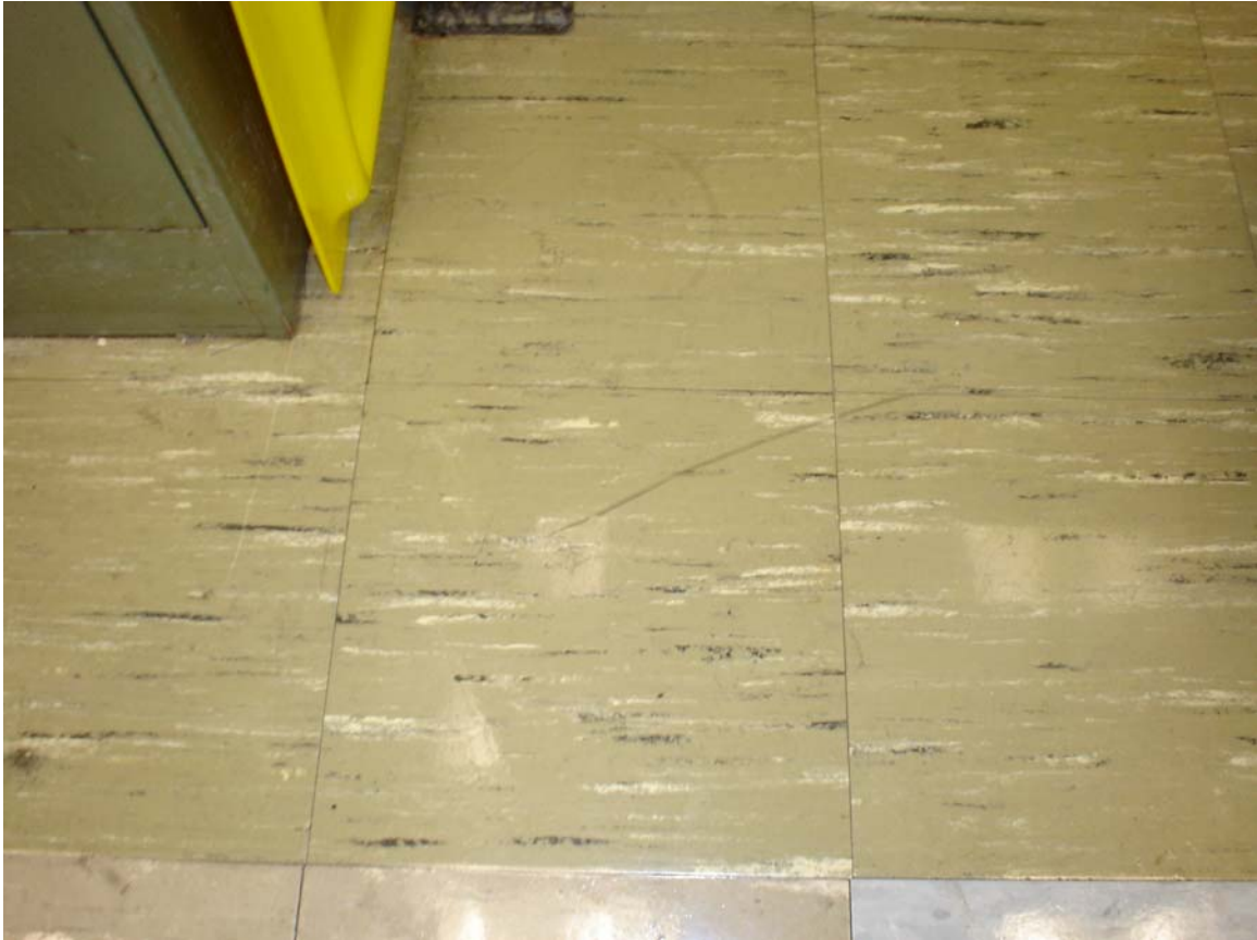
HA #13 – Asbestos-containing 9” x 9” green floor tile with cream and black streaks and associated mastic

For more information contact MSU Environmental Health and Safety – (517) 353-8956