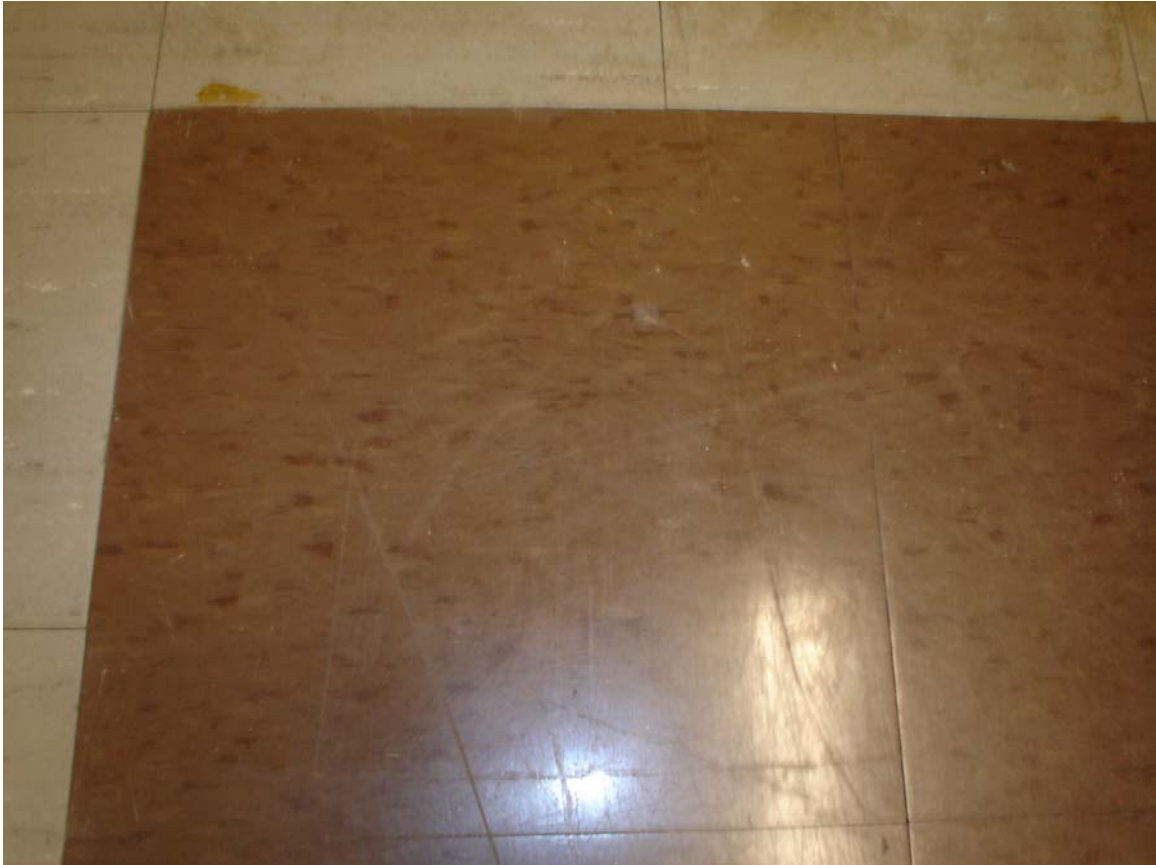
HA #28 – Non asbestos-containing 12” x 12” brown floor tile with marble pattern and associated asbestos-containing mastic

For more information contact MSU Environmental Health and Safety – (517) 353-8956