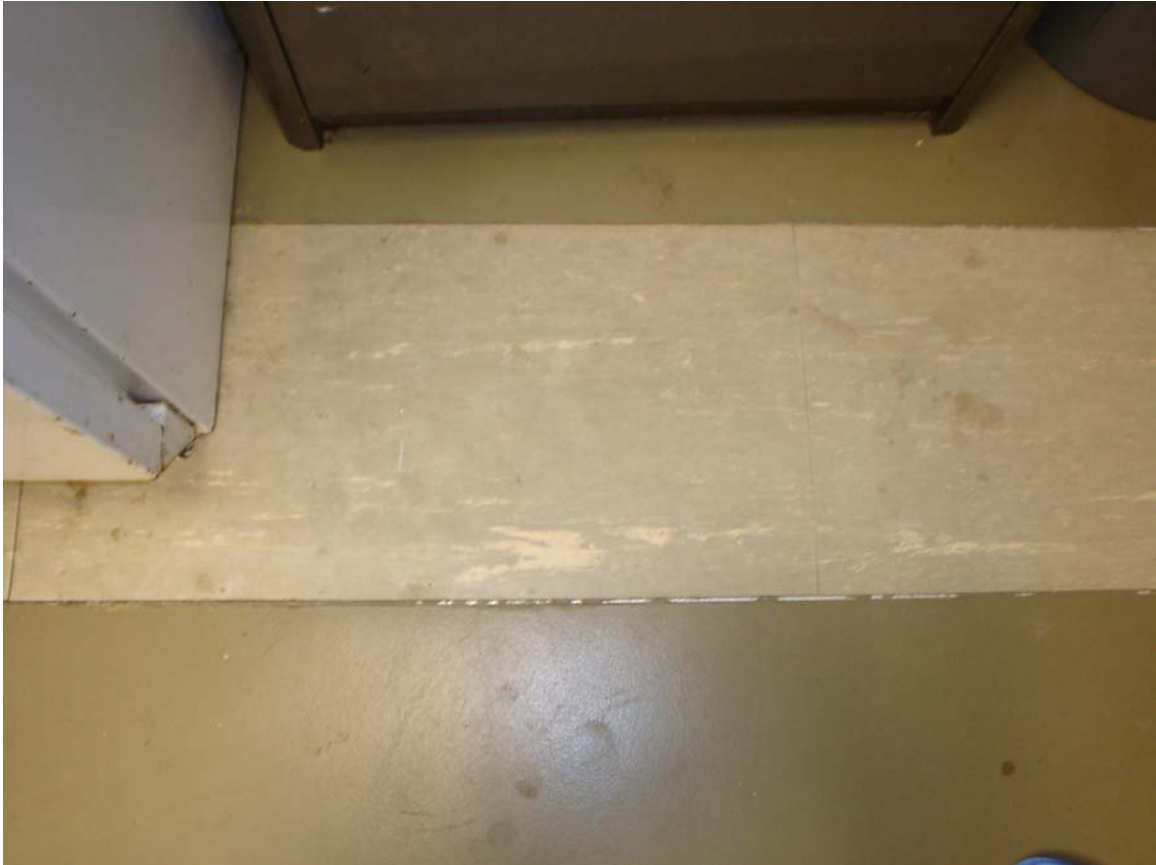
HA #7 – Asbestos-containing 1' x 2' gray floor tile with cream streaks and associated non asbestos-containing mastic

For more information contact MSU Environmental Health and Safety – (517) 353-8956