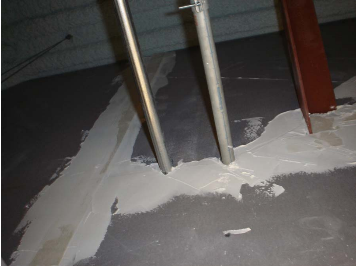
HA #58 – Non asbestos-containing drywall joint compound

For more information contact MSU Environmental Health and Safety – (517) 353-8956