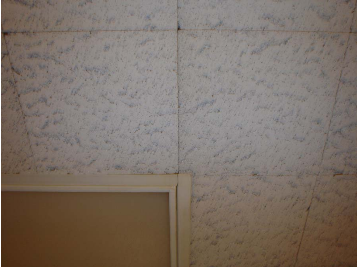
HA #47 – Non asbestos-containing 12” x 12” white spline ceiling tile with pin holes and fissures

For more information contact MSU Environmental Health and Safety – (517) 353-8956