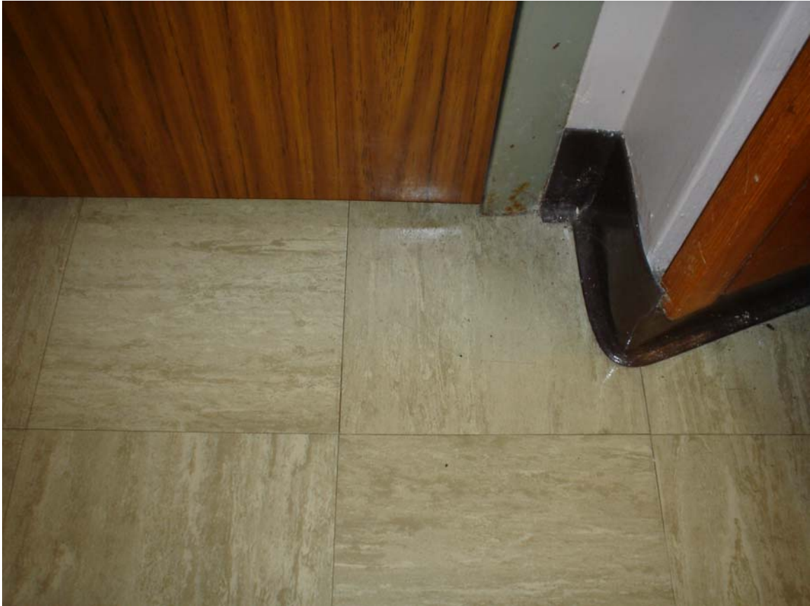
HA #33 – Asbestos-containing 9” x 9” sea-foam green floor tile with swirls and associated mastic

For more information contact MSU Environmental Health and Safety – (517) 353-8956