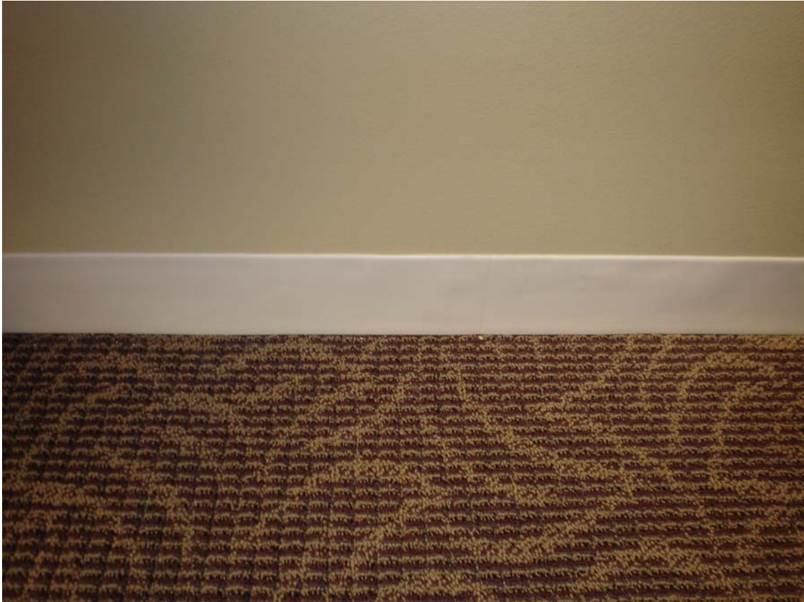
HA #26 – Non asbestos-containing 4” white cove molding and associated mastic

For more information contact MSU Environmental Health and Safety – (517) 353-8956