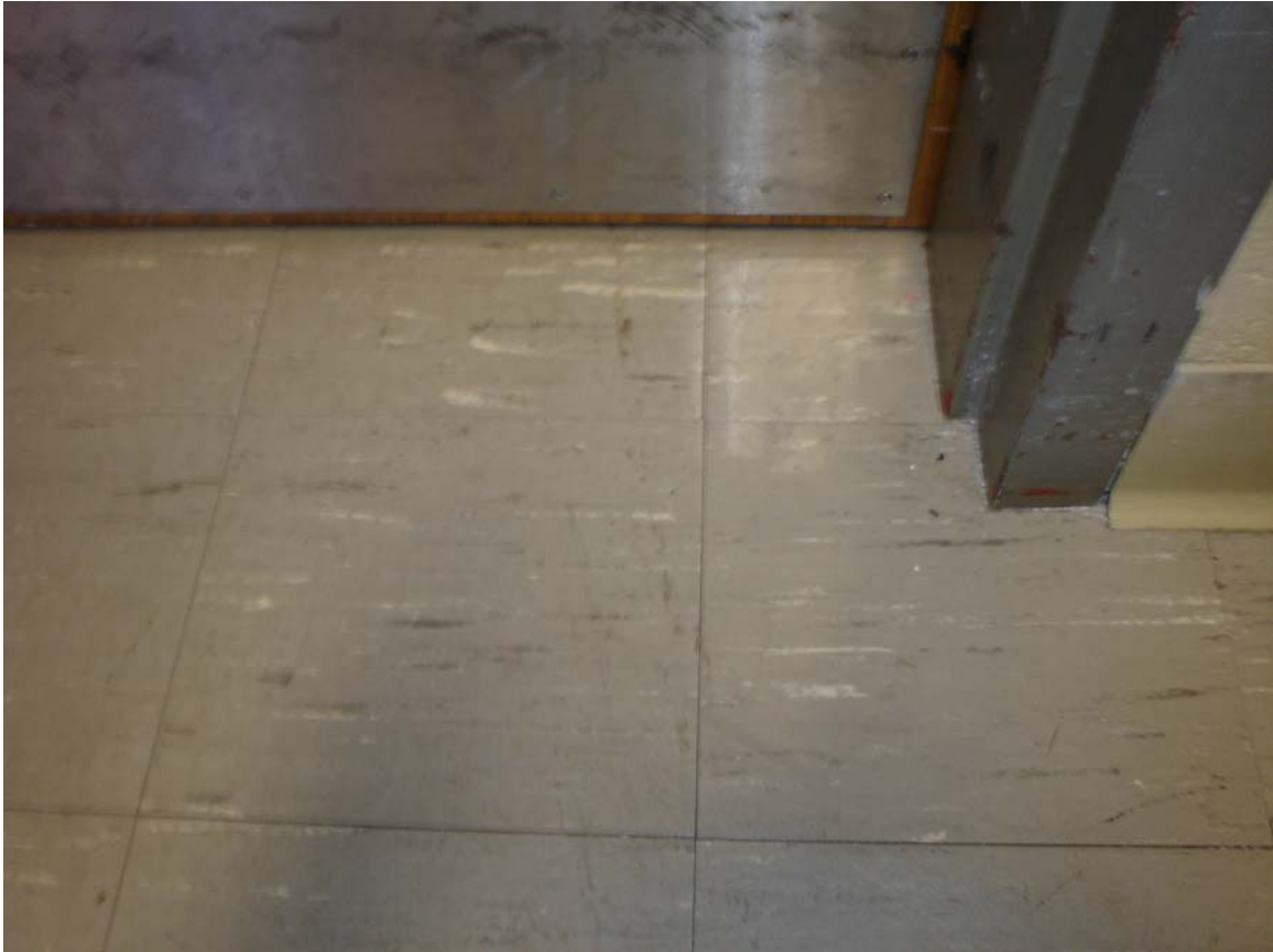
HA #8 – Asbestos-containing 9” x 9” gray floor tile with cream and gray streaks and associated mastic

For more information contact MSU Environmental Health and Safety – (517) 353-8956