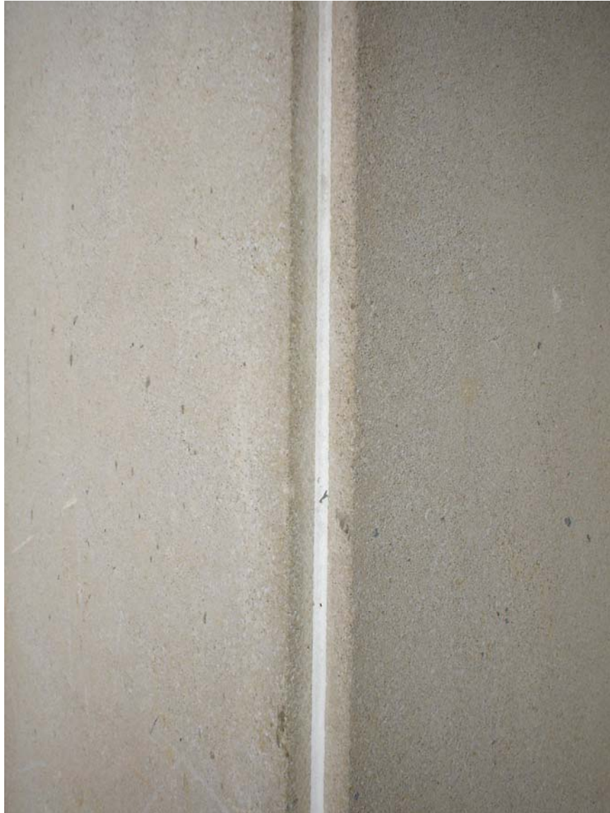
HA #30 – Assumed asbestos-containing window and door frame caulk compound

For more information contact MSU Environmental Health and Safety – (517) 353-8956