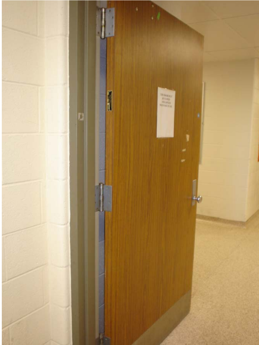
HA #23 – Assumed asbestos-containing fire door and frame

For more information contact MSU Environmental Health and Safety – (517) 353-8956