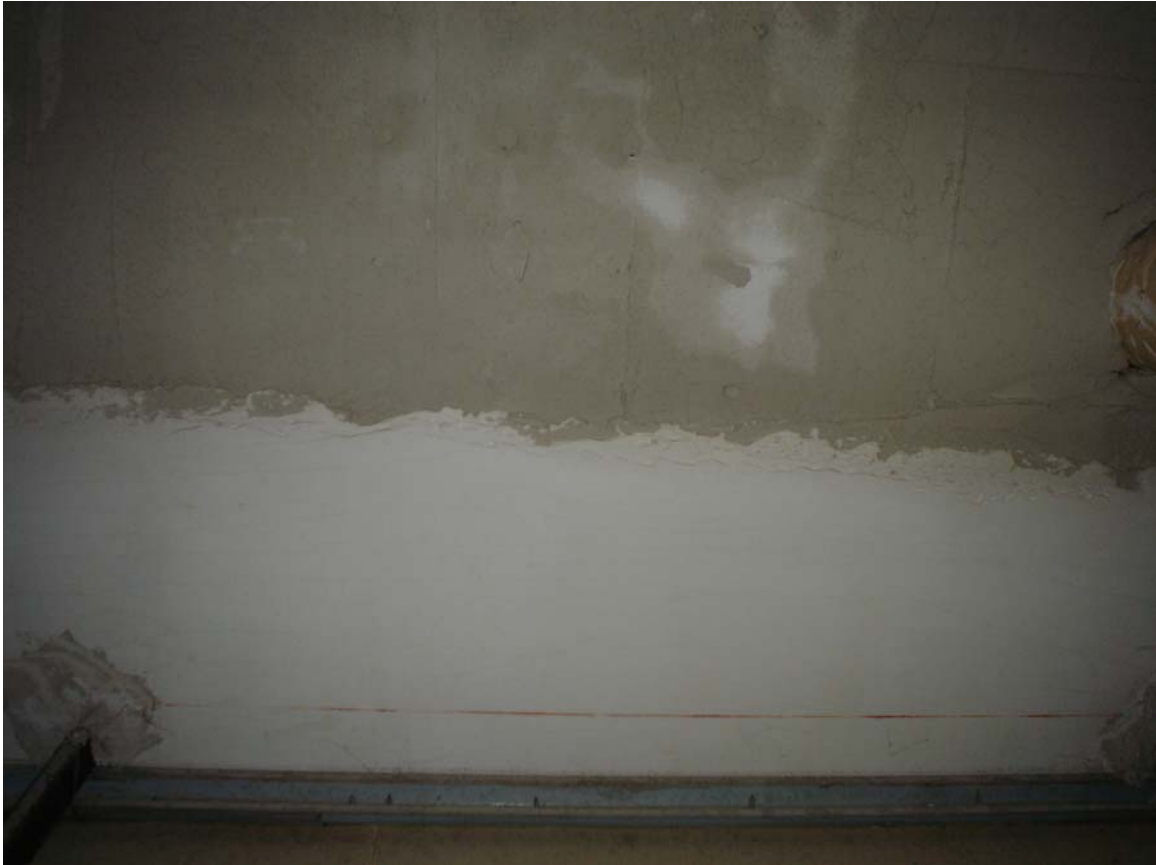
HA #58 – Non asbestos-containing drywall joint compound

For more information contact MSU Environmental Health and Safety – (517) 353-8956