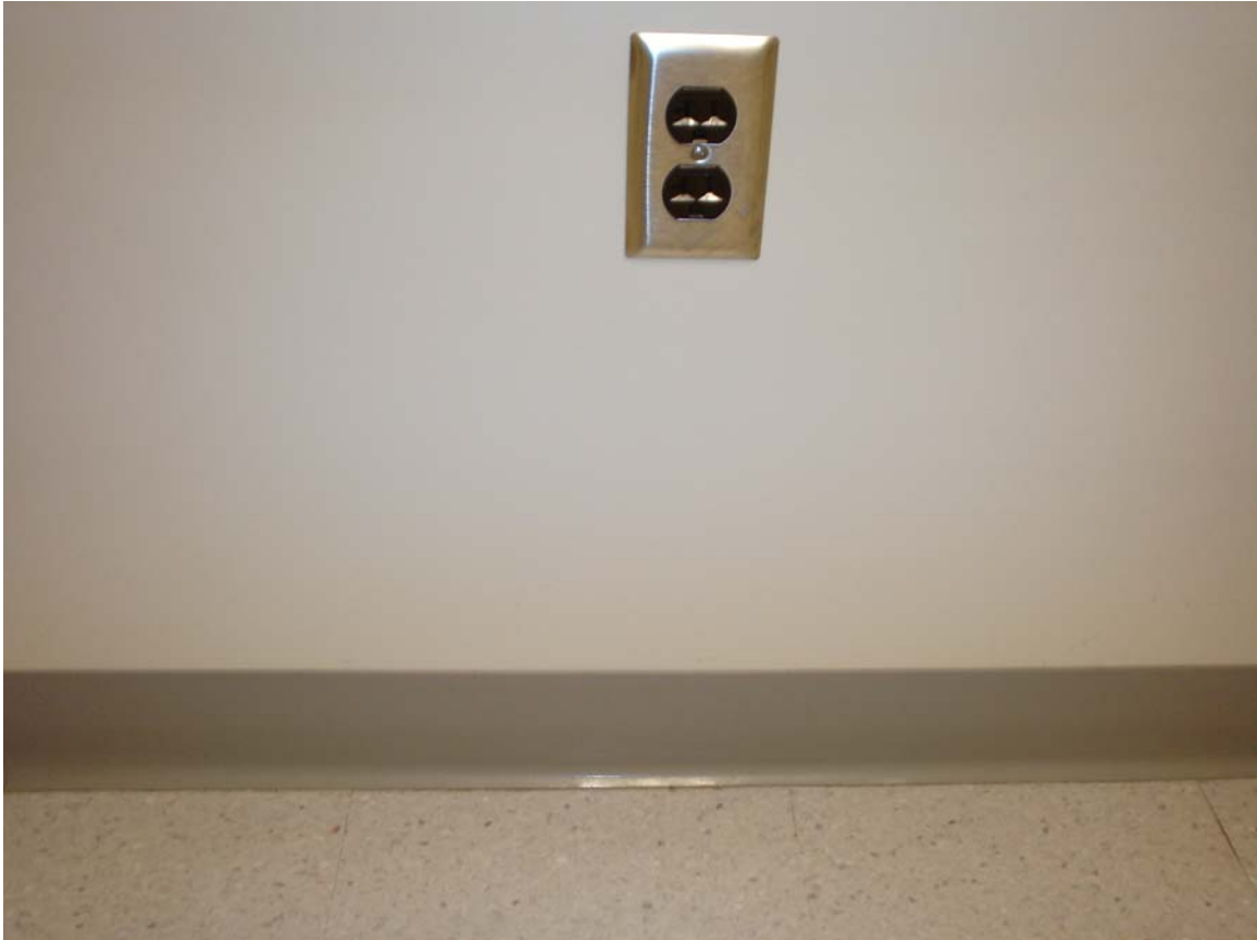
HA #41 – Non asbestos-containing 4” gray cove molding and associated mastic

For more information contact MSU Environmental Health and Safety – (517) 353-8956