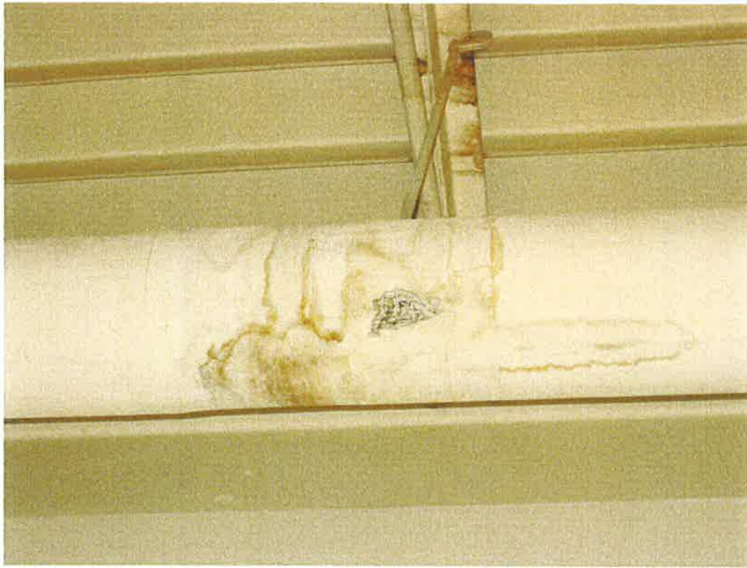
ROOM 125 - WATER DAMAGED AIR CELL