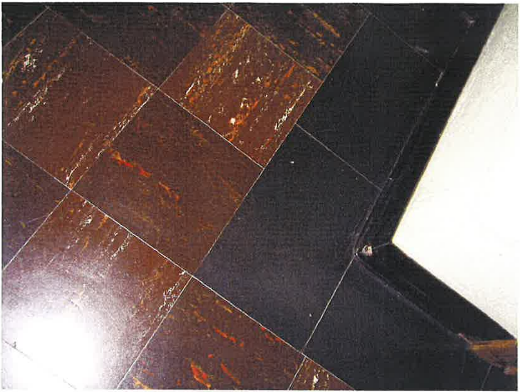
2ND FLOOR – VINYL FLOOR TILE SYSTEM