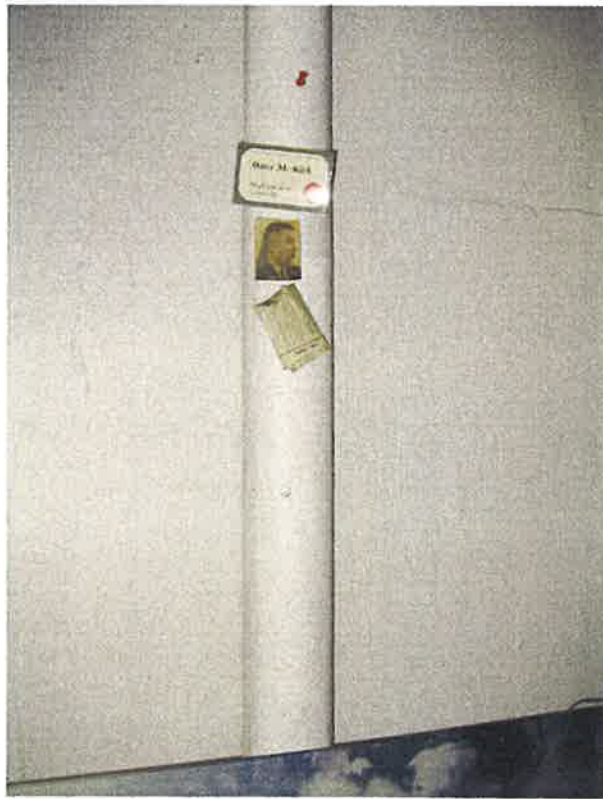
ROOM 5 - AIR CELL USED AS BULLETIN BOARD