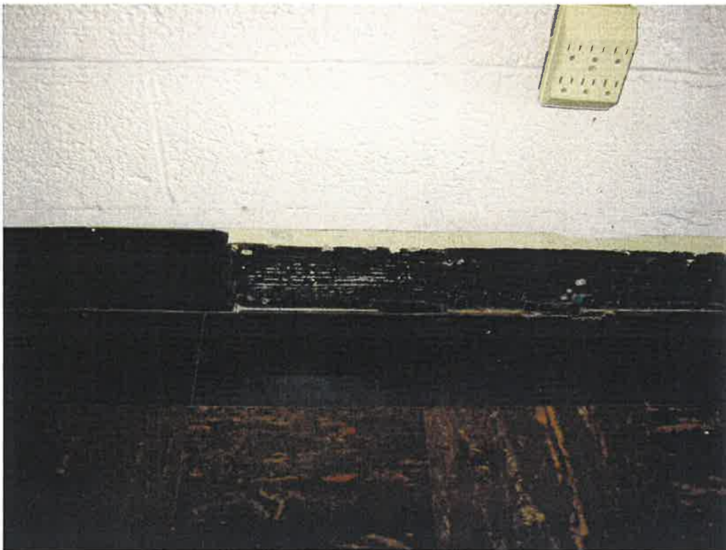
ROOM 210 - DAMAGED 6" BLACK VINYL BASE