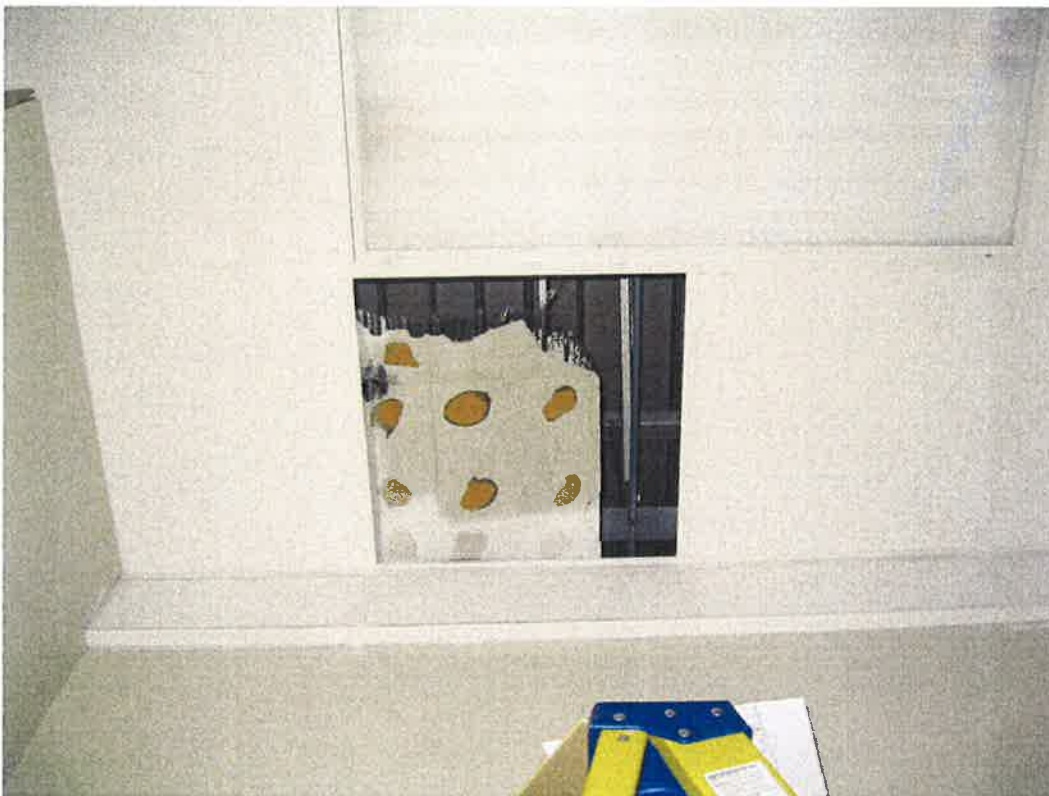
ROOM 116 - OLD CEILING SYSTEM ABOVE DROP CEILING

N: \06371\RASTER\IMG_2983.JPG N: \06371\RASTER\IMG_2983.JPG