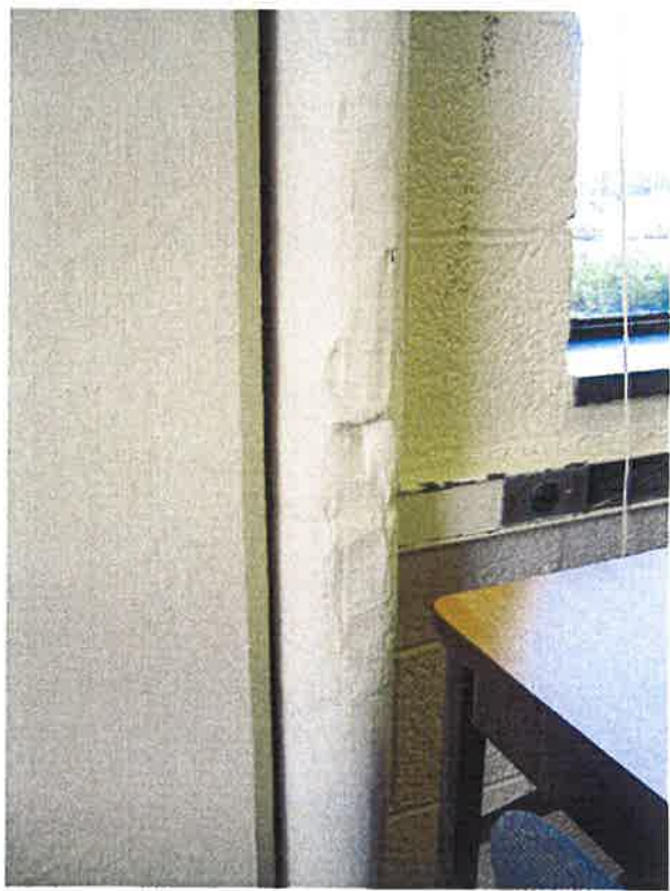
ROOM 120B - OLDER 1'X1' GLUE ON CEILING TILE AND CLUE PODS