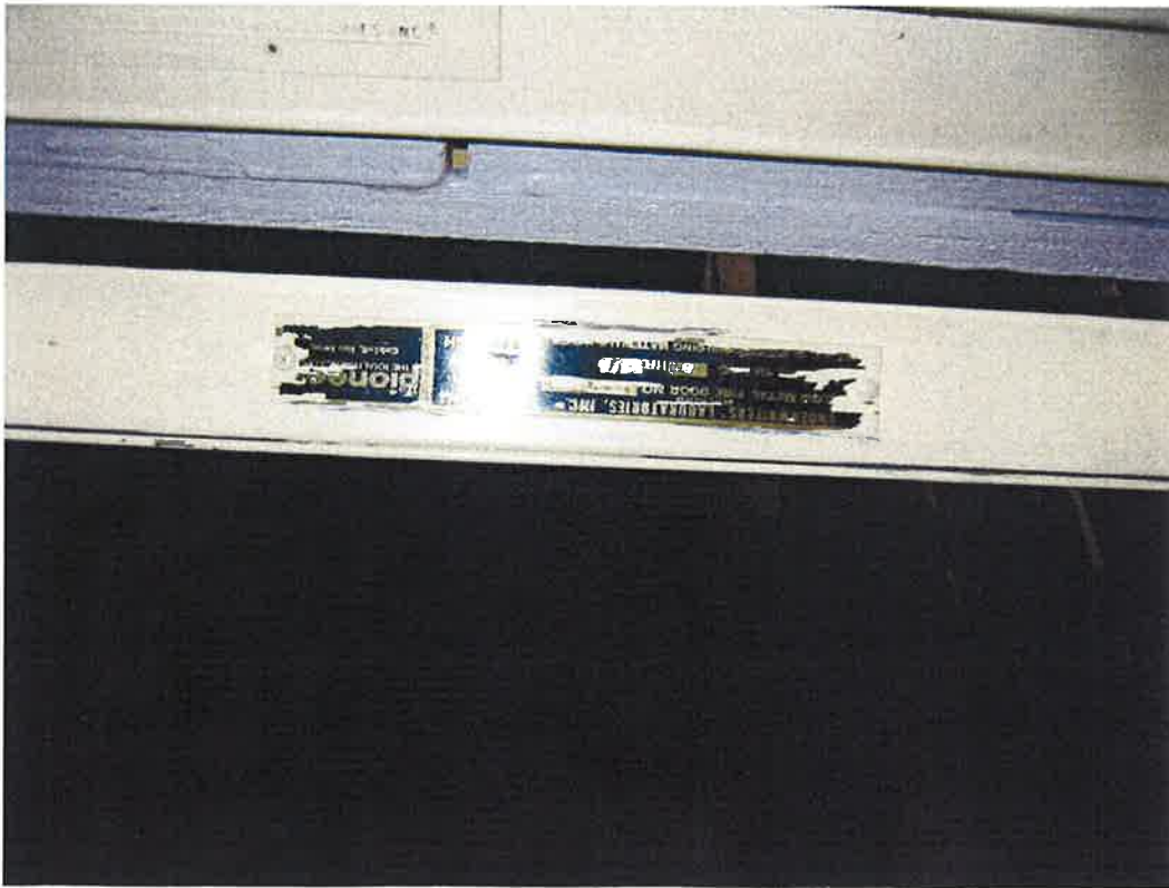
ROOM 114C - FIRE DOOR LABEL